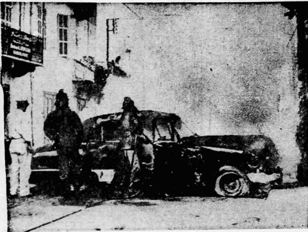
RENEWED VIOLENCE IN LEBANON—Renewed fighting has broken out in Lebanon following new President Fuad Chehab's taking office. Firemen extinguish flames of this blazing automobile in a Beirut street, after a gun-battle between rival political factions.