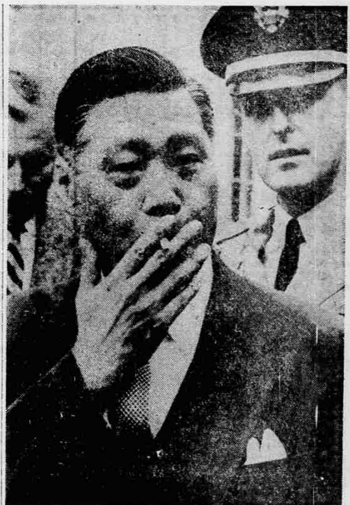
BLOCKADE A MYTH? —George Yeh, new Nationalist Chinese Ambassador to the U. S., told newsmen at the White House in Washington that he thought the Communists' artillery blockade of Quemoy had been proved a "myth." The envoy said the Nationalists, with U. S. aid, would continue to lick Communist efforts to choke off the offshore islands. Meanwhile, China's Ambassador to the UN said his country would seek to recover the Chinese mainland through a people's revolt against the regime.

All three apparently were overcome by smoke in their second floor apartment.