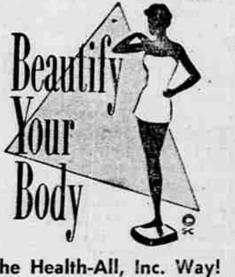
The Health-All, Inc. Way!

For those of you who have not already taken advantage of becoming a member, we urge you to come in and see just what the MEDFORD HEALTH CLUB has to offer you and your family. Just come in and enjoy refreshments and look and look around . . . and don't forget to get your FREE ticket on the beautiful SPRINGCRAFT boat that will be given away Saturday night at 9 p.m.!