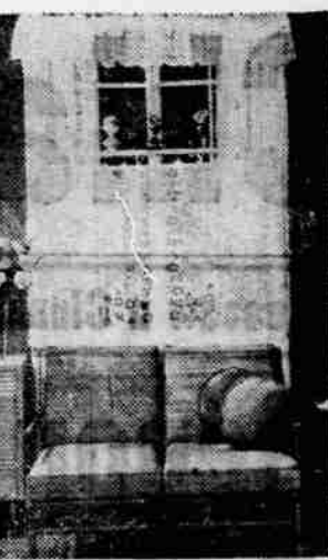
WINDOW WONDER—A cheery note is struck in this window fashion using a lower tier of cotton lace flanked by silk-length panels and topped by a matching valance. These sparkling cotton eyelet embroidery curtains are by Quaker Lace.

Stockings will not get tangled on an outdoor clothesline if one or two marbles are dropped in each toe before hanging. The marbles will weight down the stockings but will not pull them out of shape.