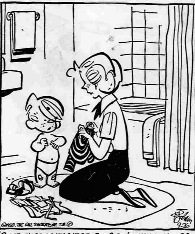
RIGHT THERE ON MY CHEST. SEE? ISN'T THAT A HAIR?*