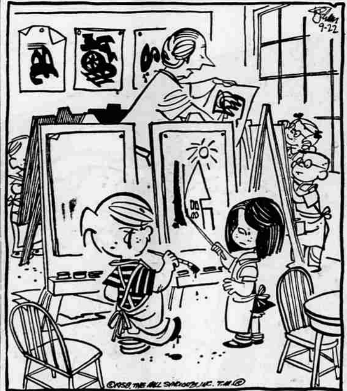
"How YA LIKE THAT CRAZY PURPLE SHOE?"