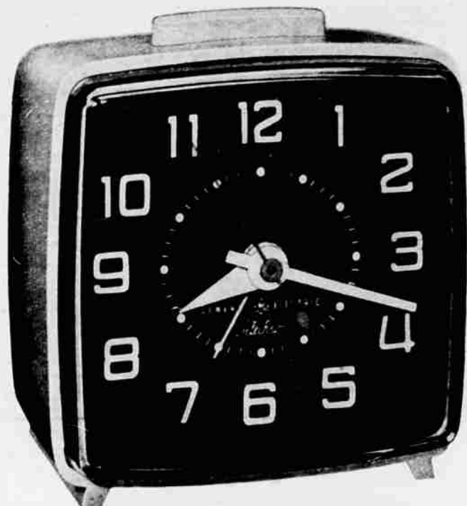
LITTLE SNOOZ-ALARM† clock, plain or luminous dial.

• wakes you • lets you snooze • wakes you again