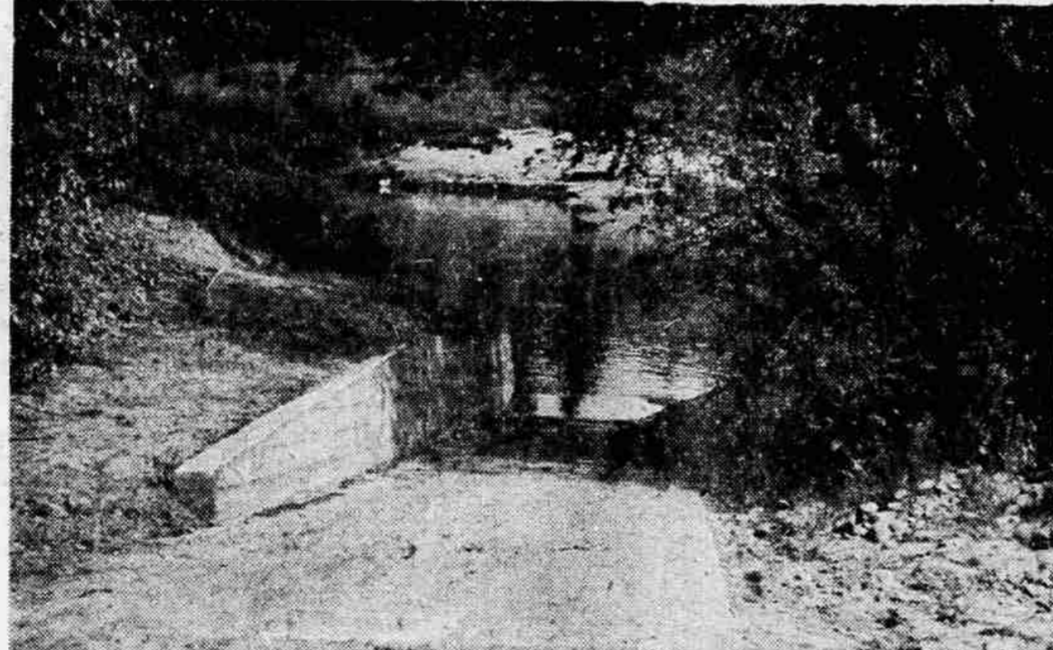
SCHROEDER PARK —The boat landing at Schroeder park, downstream from Grants Pass, is shown above. The landing is located off Leonard rd. below the Redwood highway. The concrete ramp was provided by the game commission and Josephine county. Included in the park is a parking area and adjacent picnic grounds.