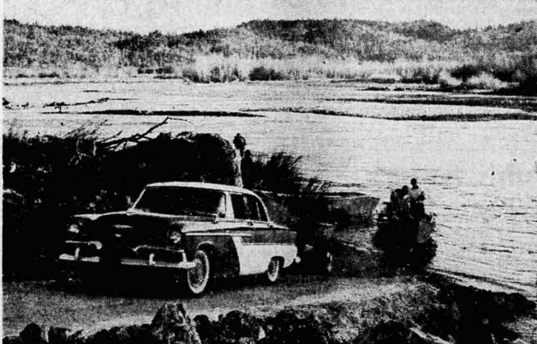
AT ROBERTSON BRIDGE —The boat landing at Robertson bridge, on the Rogue river west of Grants Pass, is being used by fishermen. Parking area and large concrete ramp developed by the game commission with the highway commission cooperating.

Lathrop landing, Schroeder park, sportsman's ramp in Grants Pass, Green creek, Rogue River, Ben Hur Lampman State park, Gold Ray, TouVelle park at Bybee bridge, Dodge bridge, Shady Cove, Elk creek, Casey park, McLeod park, and Peyton bridge. (Game Commission map)