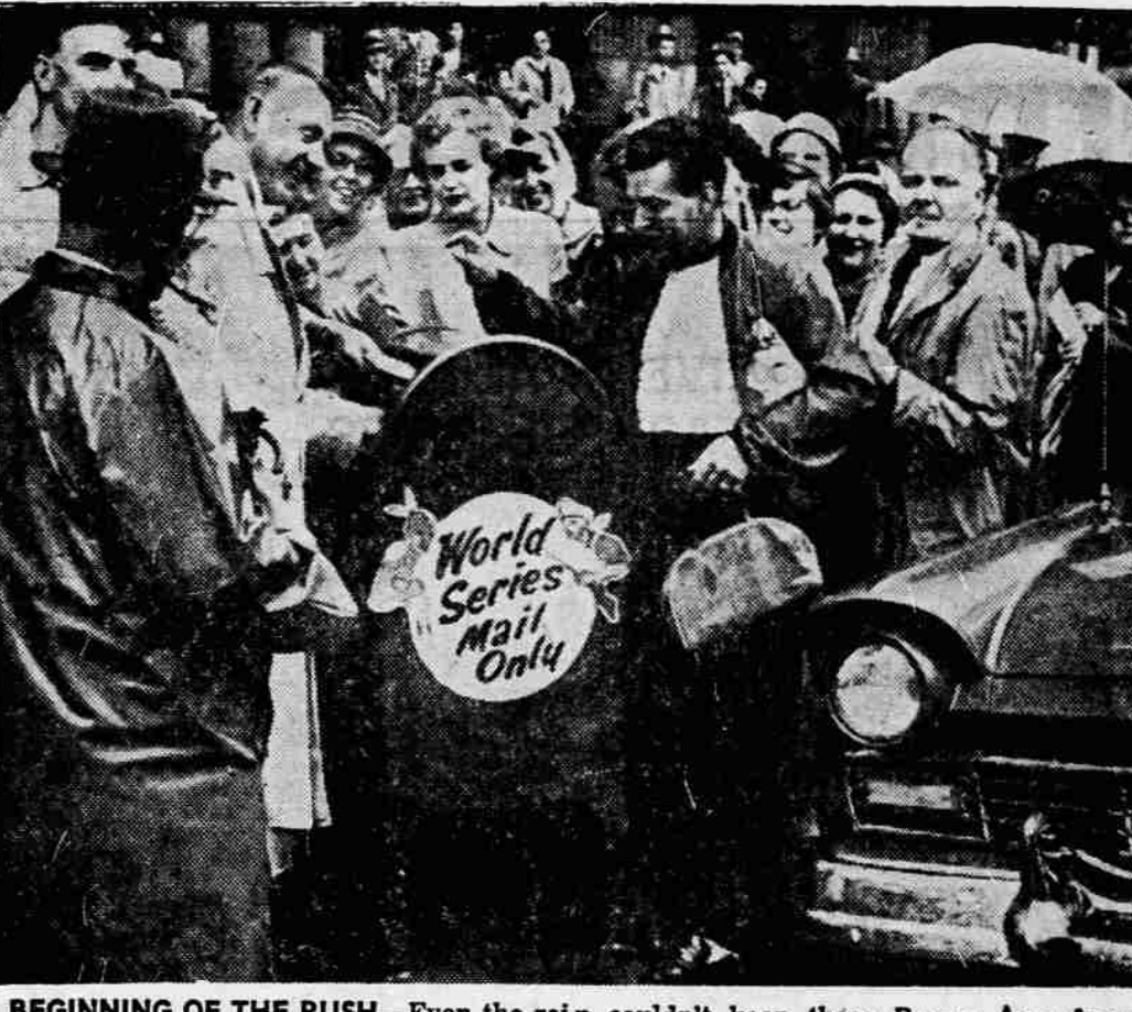
BEGINNING OF THE RUSH —Even the rain couldn't keep these Braves fans from piling up outside the Federal Building post office in Milwaukee to mail their applications for World Series tickets. In anticipation of another Milwaukee pennant, special mail boxes were set up handle the heavy volume of mail.

Stained glass dates to the 11th Century.