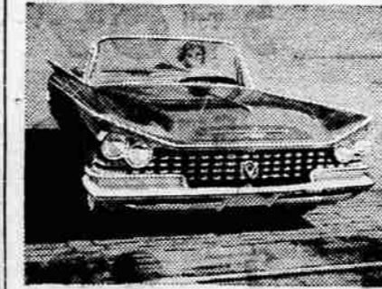
THE LOOK. A clean, lean, new kind of fine-car look. The look of the best-engineered, best-manufactured Buick ever built . . . and the most excitingly beautiful design in Buick's nearly 60 proud years.

Here it is . . . and now you know! Know why we have called this THE CAR . Know that a new generation of great Buicks is truly now here. From just this one view you can see that here is not just new design . . . but splendidly right design for this day and age. A car that is lean and clean and stunningly low . . . and at the same time great in headroom and legroom, easy to get into or out of. And when you see your Buick dealer and walk the whole wonderful way around this Buick, you'll know still more how right all this is. From anywhere you look, here is a classic modern concept that is Buick speaking a new language of today. A language of fine cars priced within the reach of almost anyone. A language of quality and comfort and quiet pride of ownership. And when you see your quality Buick dealer and get behind the wheel, the car will speak to you in a language of performance satisfactions without equal.