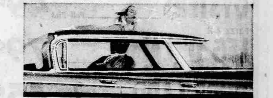
THE QUALITY. Buick quality to the core, new super-quiet bodies by Fisher. New Magic-Mirror finish retains its beauty longer. New interior décor throughout. Safety-Plate Glass everywhere. Magnificent new quietness, new comfort, the feel of fine-car quality everywhere! Yours to test, yours to savor—the magnificent new Buick for 1959.