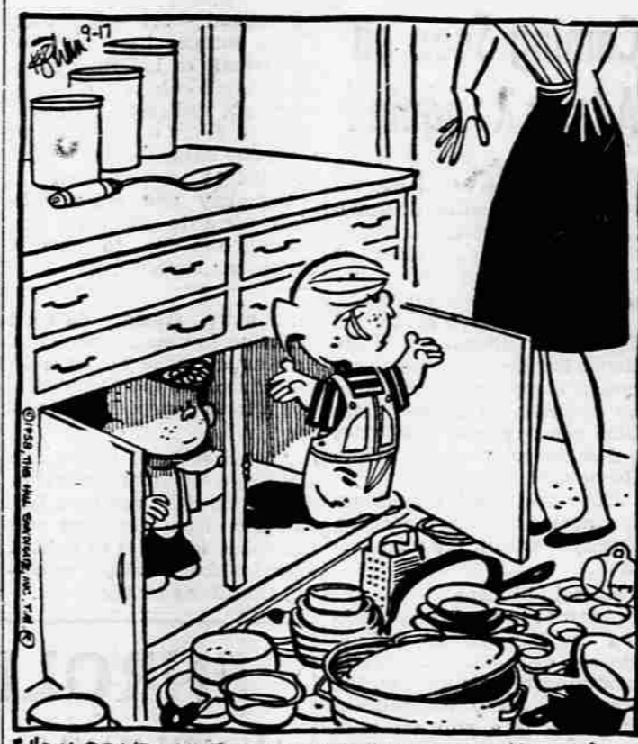
“HOW DO YOU LIKE OUR NEW CLUBHOUSE, MOM?”