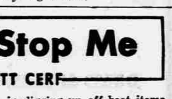
HERE'S A RARE ITEM.