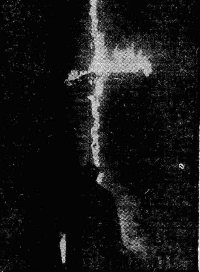
PRELUDE TO VIOLENCE —Shadowy figures of Ku Klux Klansmen loom before a burning cross at a KKK rally on Stone Mountain outside Atlanta, Ga. While making pictures, a UPI photographer was attacked by Klansmen, who tore his shirt, broke his glasses, and seized his equipment. He was allowed to take out this picture of the burning cross only. He was told the rest of his equipment would be returned to him "through secret channels."