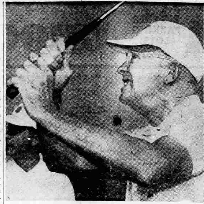
VACATION TIME—President Eisenhower follows ball on his first tee-off at the Newport, Rhode Island Country Club as he started the first game of golf of his late-summer vacation. The golf course is two minutes drive from his summer White House at the Navy's Fort Adams.