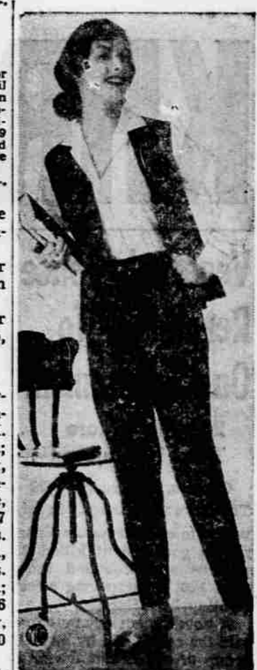
Printed corduroy looks at home in lounge togs styled by Edith d'Errecaide for Evan-Picone. The tapered pants, sleeveless vest and white top are a relaxed trio.

Platinum, more valuable than silver, was originally found in a South American area now part of Columbia.