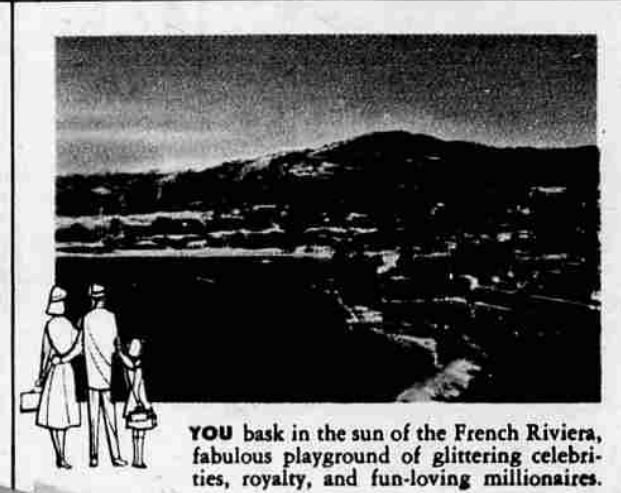
YOU bask in the sun of the French Riviera, fabulous playground of glittering celebrities, royalty, and fun-loving millionaires.