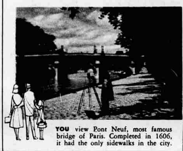
YOU view Pont Neuf, most famous bridge of Paris. Completed in 1606, it had the only sidewalks in the city.