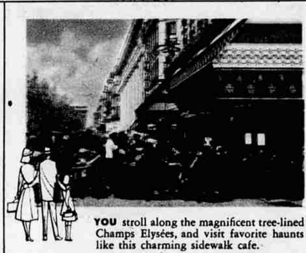
YOU stroll along the magnificent tree-lined Champs Elysées, and visit favorite haunts like this charming sidewalk cafe.