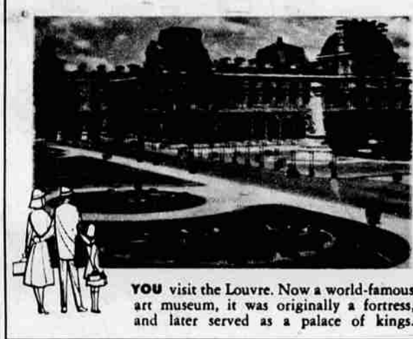
YOU visit the Louvre. Now a world-famous art museum, it was originally a fortress, and later served as a palace of kings.