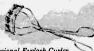
Professional Eyelash Curler