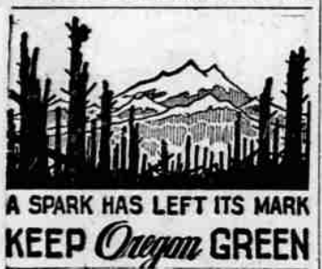
A SPARK HAS LEFT ITS MARK KEEP Oregon GREEN

The Illinois Valley Rural Fire Protection volunteer firemen were declared the champions of Josephine county as winners of the tug-o-war bat-