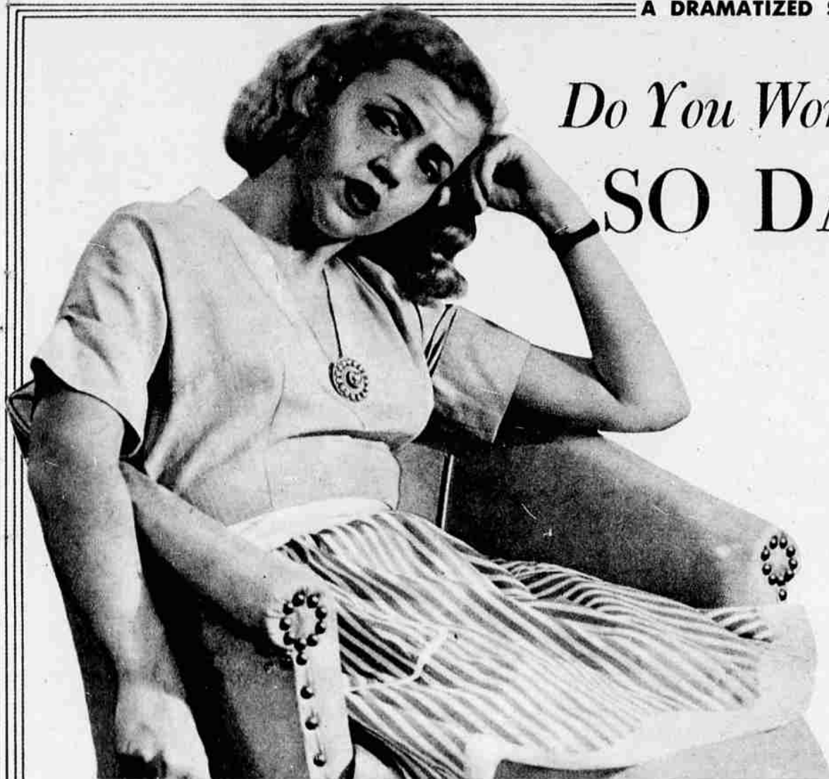
Posed by professional model

I used to feel weak and run down from the moment I woke up in the morning to the time I tumbled into bed at night. And believe me, I know how miserable this condition can be! Taking care of a home and family is a hard enough job even when you feel good. But trying to be a good mother and wife when you barely have the strength to move around would make any woman a nervous wreck!