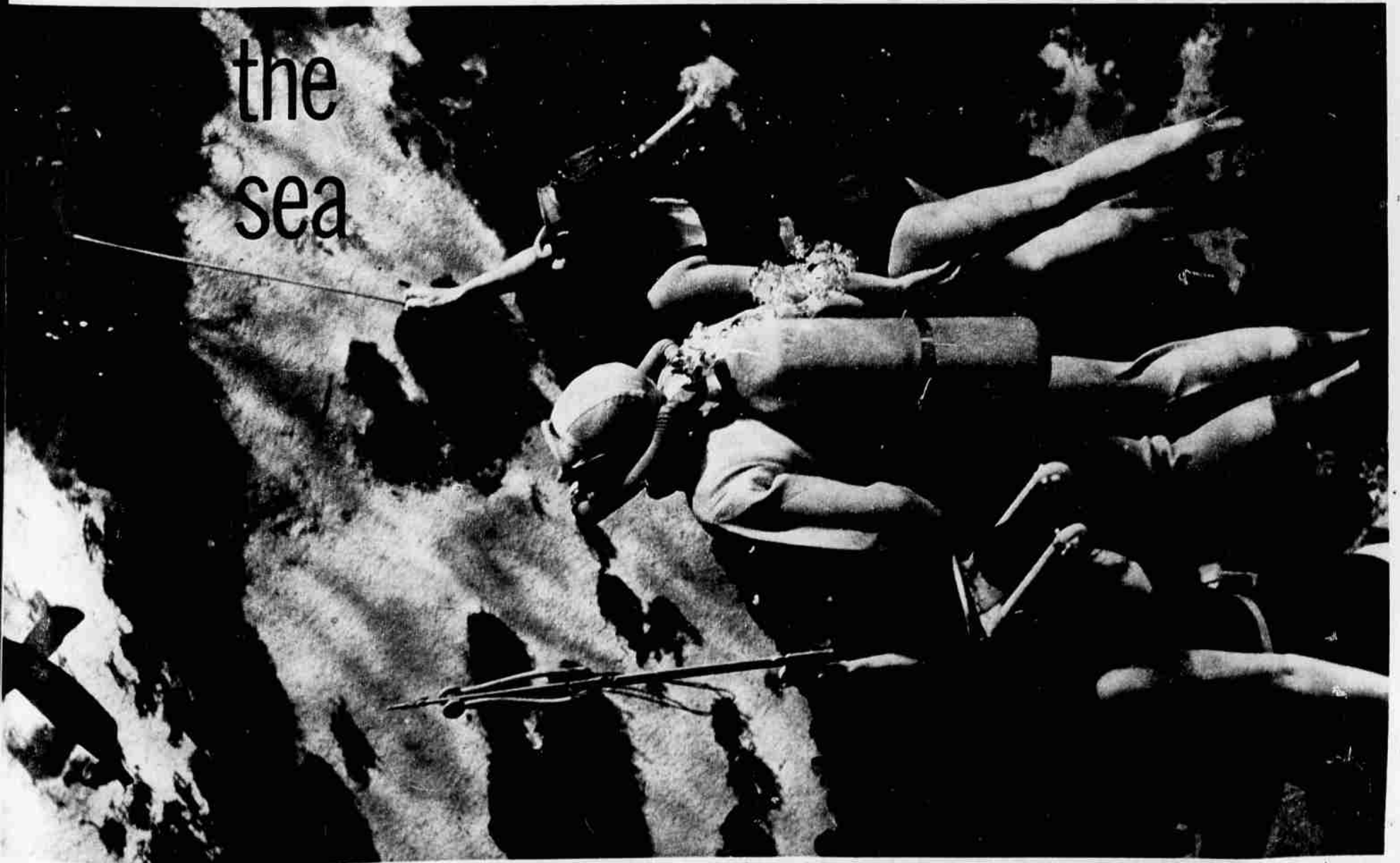
Using both basic and advanced types of breathing apparatus, these rubber-finned skin divers glide almost effortlessly through a slow-motion world of alien beauty.