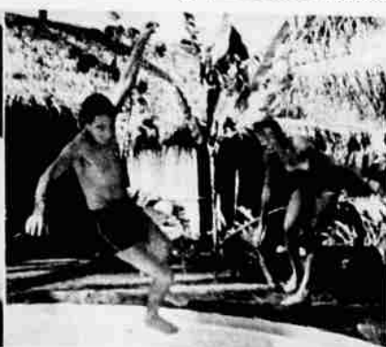
Bride puts hubby in his place.