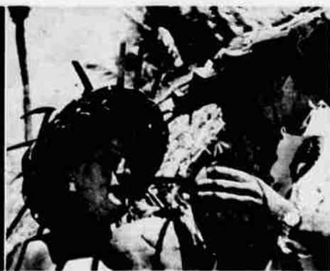
It's time for a coconut break.