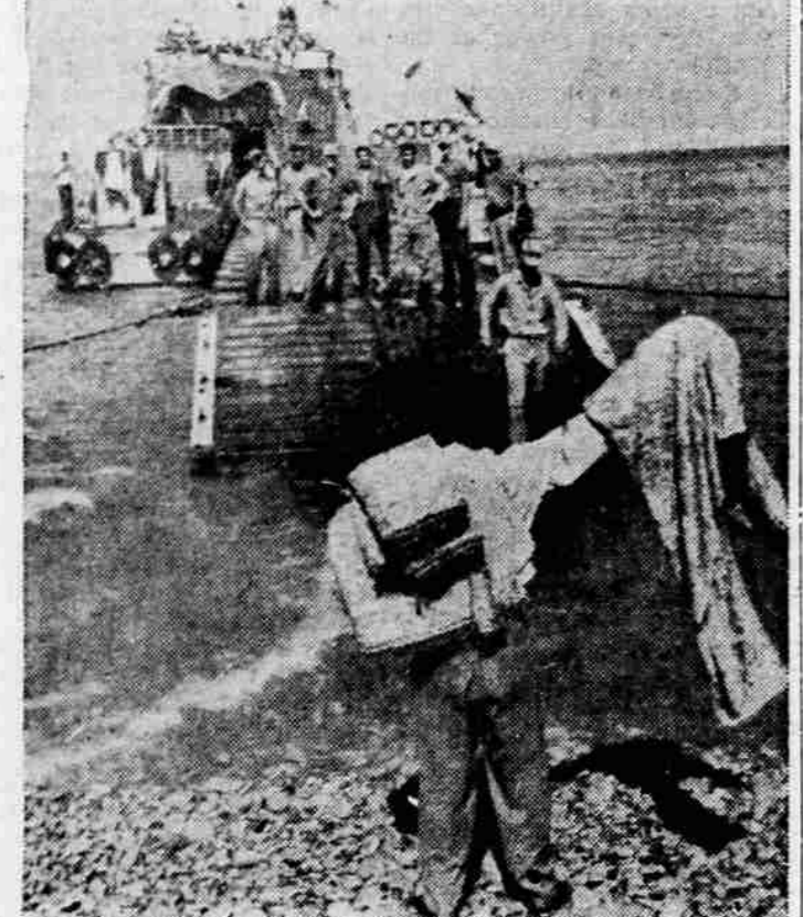
PERSISTENT SALESMAN —Making a last-minute sales pitch, a Lebanese carpet vendor offers his goods to a group of U. S. Marines leaving Lebanon. It's apparent that the vendor hated to see the Marines go since they represented fine prospective customers.