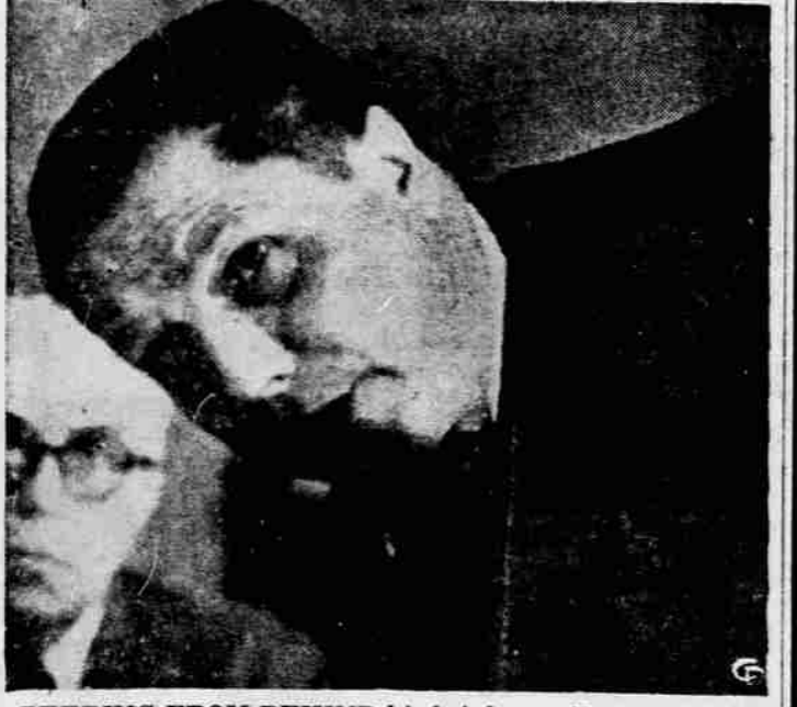
PEERING FROM BEHIND his brief case, Teamster President James R. Hoffa searches for data to present to the Senate Rackets Committee. Not taking the Fifth?

MERCURY PERFORMANCE CHAMPION FOR '58 ACT NOW—SAVE BIG! SEE YOUR MERCURY DEALER TODAY!