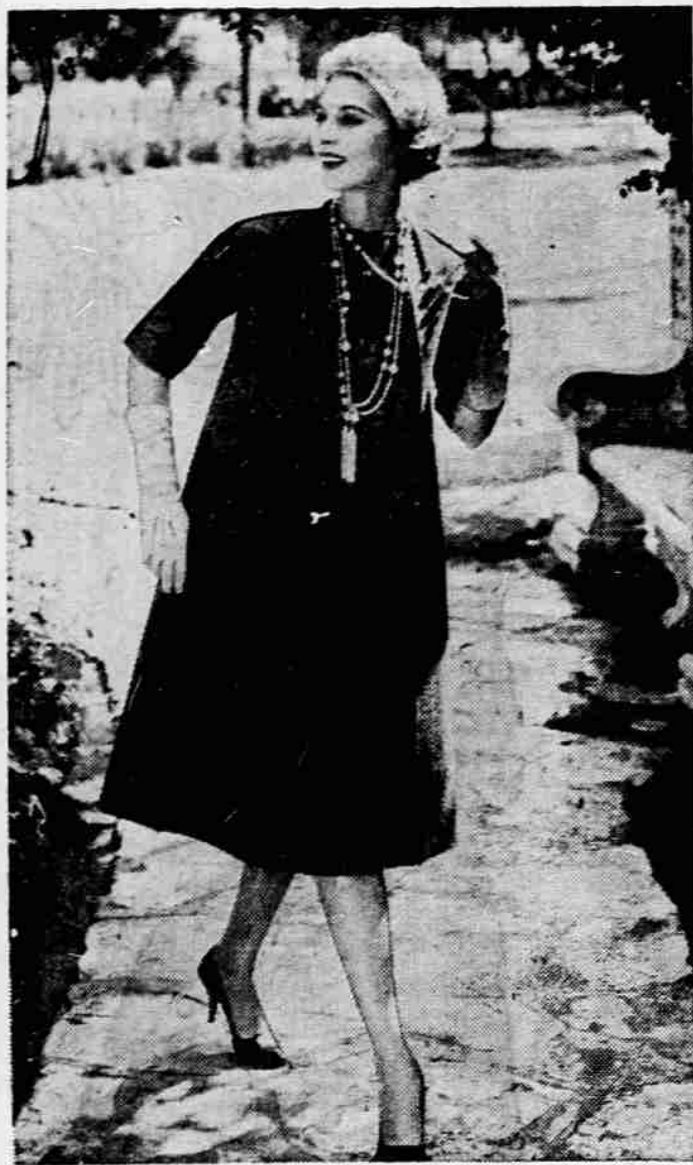
WOOL JERSEY —Heralding the swing to the trapeze silhouette is a gaily youthful dress in worsted wool jersey. Outside welt seaming and inner details accent the shape. By Rudi Gerneich for Walter Bass company.