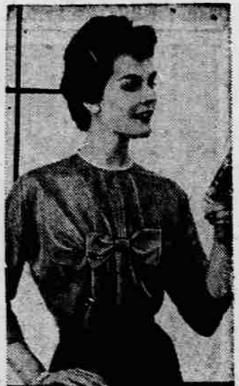
JEWEL NECK —Worthy of special occasions is jewel neck blouse, with soft tucking radiating from a fluttering mid-center bow. By Adelaar in Tycora crepe.

New iridescent fabrics, solid deep tones, wash-wear constructions and other handsome new models have made these coats the favorite garments of men across the country. There are the easy-to-slip-into raglans for business wear that come in sand, oyster, white and putty shades; the formal blacks lined with deep red for evening wear with tails or tux; and the sporty short length car coat designed for skating.