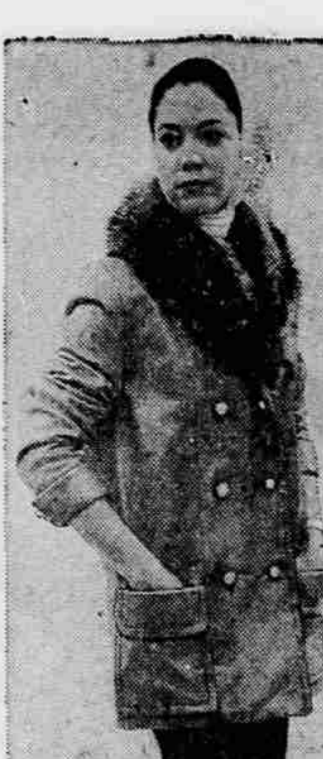
CAR COAT —Set for lots of fall fashion mileage is the car coat, here in red leather with raccoon collar, brass buttons.

Fall stylings are about evenly divided between "formal" and "casual." Among elaborate stylings there's news in the carved designs of thick-pile rugs.