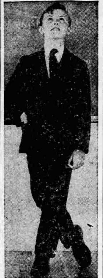
TOP HONORS —go to the "wash and wear" suit, shown here in a soft banker's gray flannel of Orion acrylic fiber and rayon. Can be dunked in the washing machine, and needs little if any ironing! Can be worn almost all year-round.

Color runs the gamut from pastels to rich jewel tones. Black looks newest with contrasting embroidery. There is much use of applique designs and lace.