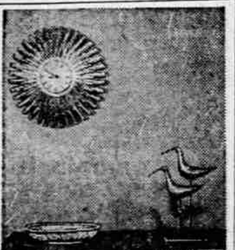
SUNBURST —Shining Hours' clock adapted from the classic sunburst, is dramatic as well as functional wall decoration. By General Electric-Telectron.