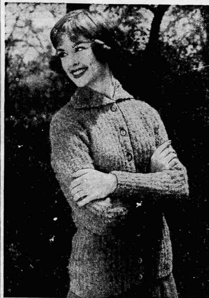
LOOPED MOHAIR —Mohair and color unite to create some of the most exciting news in fashion for fall. Among the leaders in this trend are looped mohair sweaters, vividly colorful. Sweater shown is hip length and distinctively styled with easy lines, perky pointed collar and tapered sleeves. It's available in a color choice of blue, mango, emerald, pumpkin, school-house red, brisk brown, white or black. Sweater by Select.

Coordination reaches a high point in sets combining gloves with matching scarfs, belts, bags, collars or headbands.