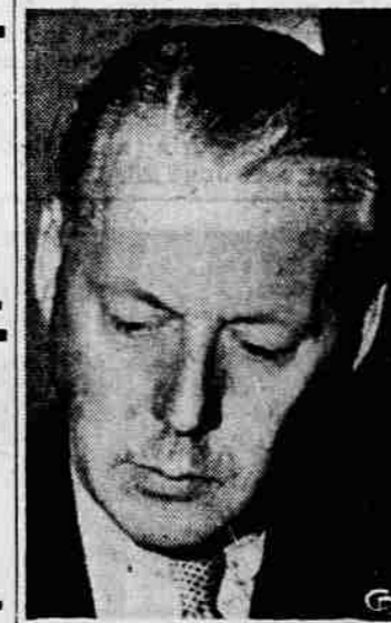
RESIGNING effective Sept. 1, Arthur Larson, special White House assistant, says he will continue as special consultant to President.