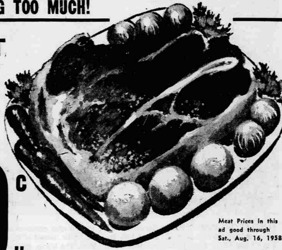
Meat Prices in this ad good through Sat., Aug. 16, 1958