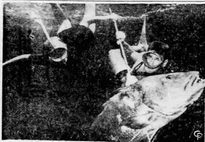
GRABBING TOP OF SPEAR, Clare Boothe Luce, former ambassador to Italy, joins Art Pinder, spearfisher, in killing big snapper at New Providence, Bahamas. She is gathering material for articles on diving in Bahamas coral reefs.