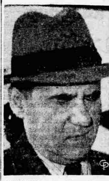
ARRIVING in New York, Soviet Foreign Minister Andrei Gromyko listens to aide brief him on United Nations.

Portland Hay, Grain Portland—Wholesale Hay Prices: New crop No. 2 green alfalfa, baled, f.o.b. Portland and Seattle, $25 ton.