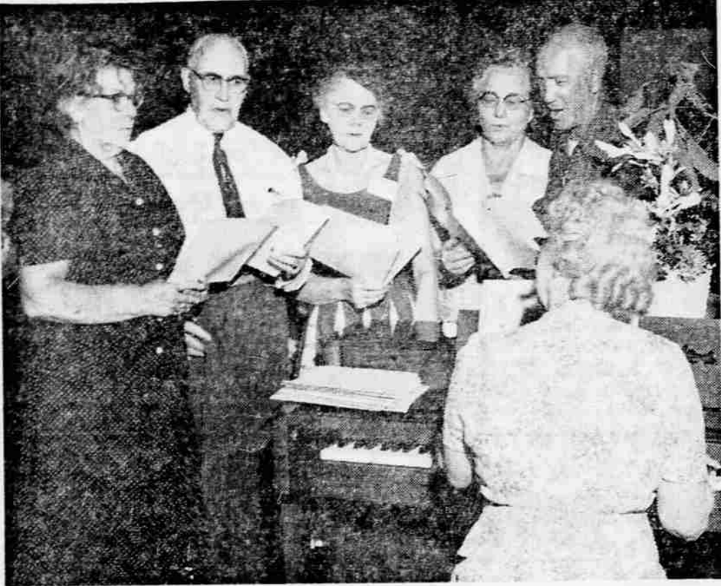
SINGING SESSION —Part of the activities of the recently-organized Medford Fifty-Plus club is singing songs from a list of old favorites selected by club members. The group made up special song books for use when they get together. The picture above was taken at a recreation meeting of the club held Friday in the Red Cross Chapter