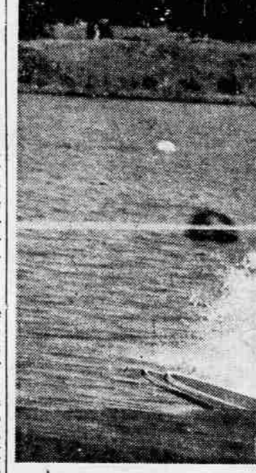
TRICK SKIING IN TOURNEY —Ni Orsi, Stockton, Calif., demonstrates a trick water skiing maneuver in practice at Gardener lake. The scene is typical of what fans saw yesterday during the Western Regional

Poison Oak? Try a Bottle of ZEMACOL You must be satisfied or your money cheerfully refunded. Get a bottle today at WESTERN THRIFT