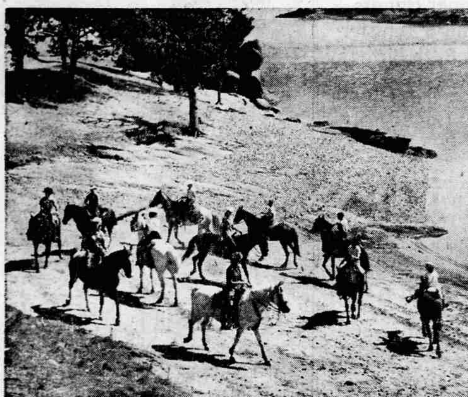
The Sage Riders, organized in May of this year, are already an accomplished drill team, and can do a number of intricate maneuvers as a unit. Above they form a double circle with the inside group going in one direction and the outside the other.