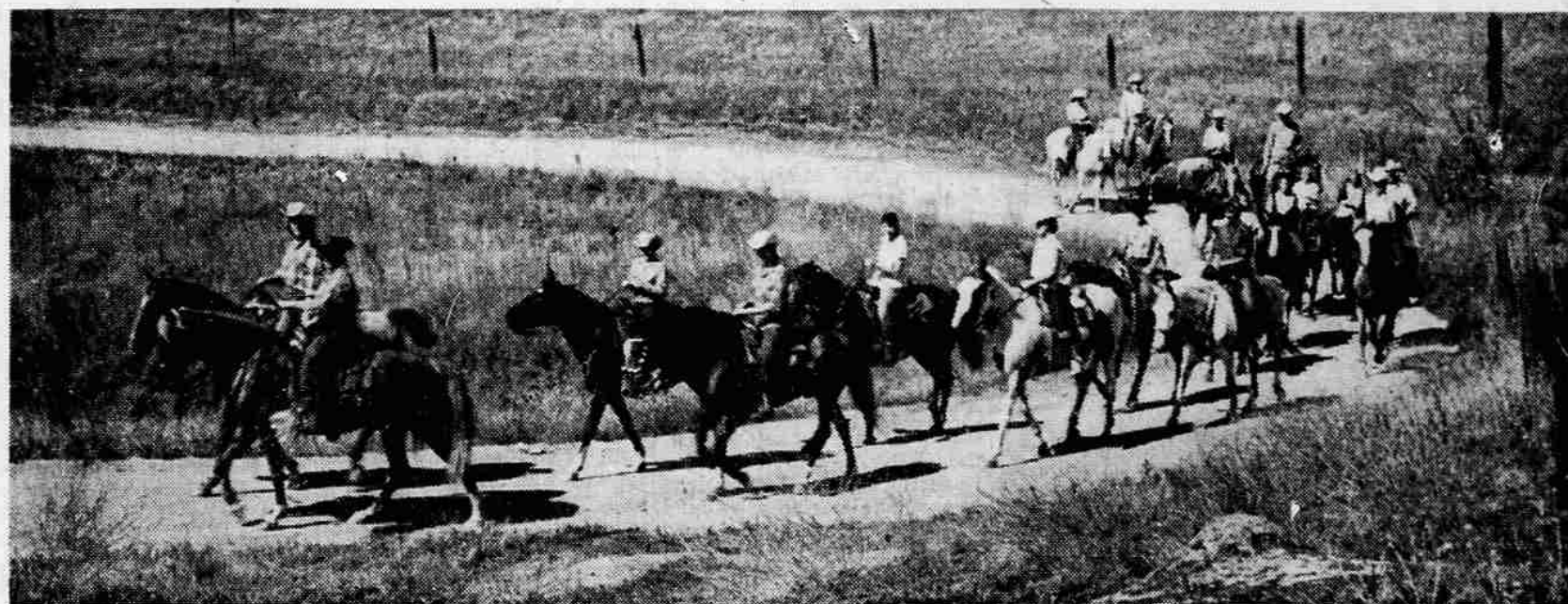
Listening to the soft "chik chok" of horse's hoofs on the dirt road and the squeak of saddle leather, members of the Sage Riders round a bend on the last leg of their 12 mile trail ride to Immigrant lake. The group started out at 6 a.m. from Jackson Hot Springs and camped out for the night after bedding was brought to the site by pickup truck. Another pickup served as the "chuck wagon."