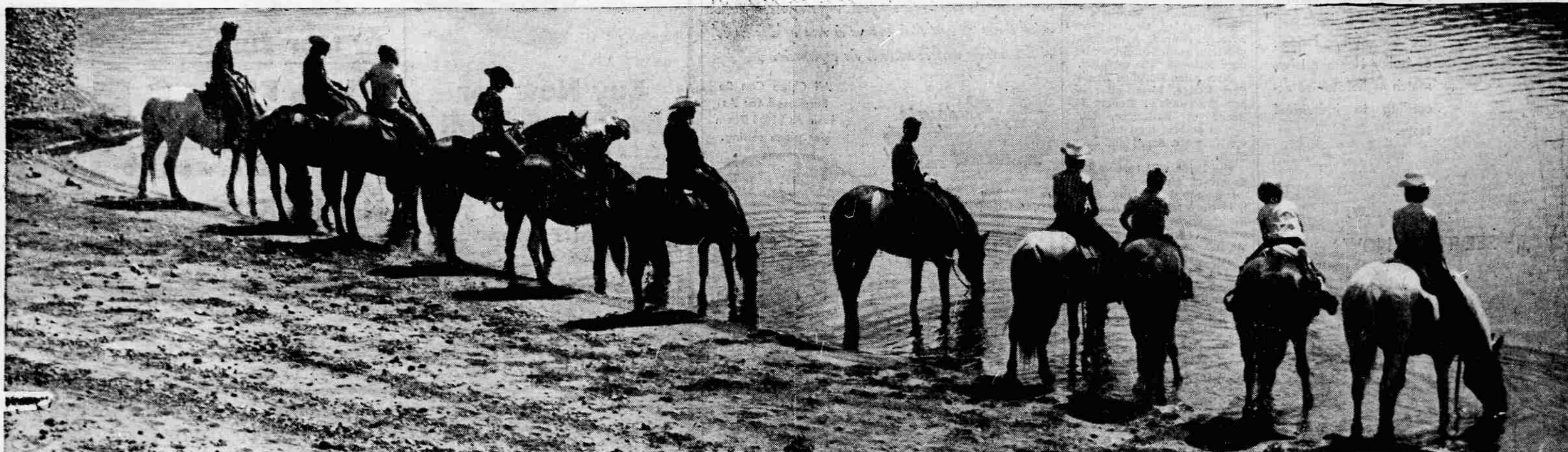
Watering their horses on the edge of Immigrant lake after a long ride, the Sage Riders and their mounts make a picture that is reminiscent of the days of the old west, when horses were the main means of transportation.