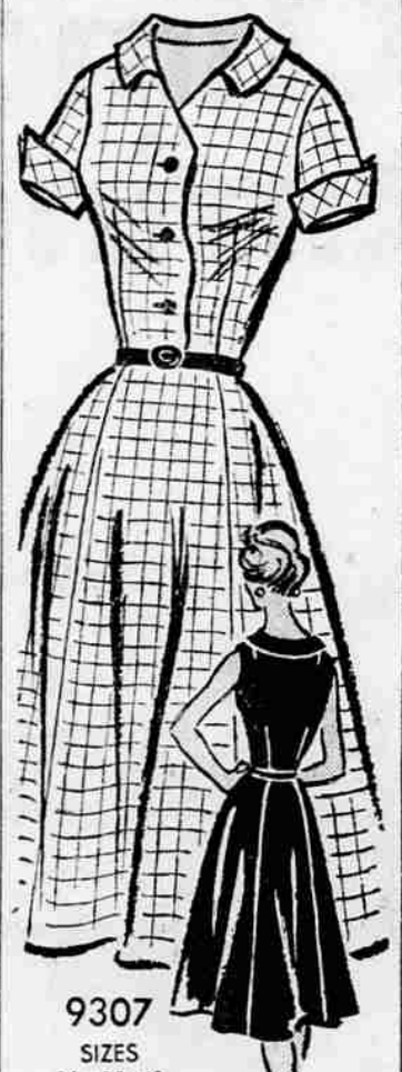
9307 SIZES 12-20, 40 by Marian Martin

Love of your life! Your favorite shirt dress in a smart, new version for busy fall days ahead. Choose crisp checks, stripes, or solids — have all three and never have another "what-to-wear" worry. Simple Printed Pattern. Printed Pattern 9307: Misses' Sizes 12, 14, 16, 18, 20, 40. Size 16 takes 4 3/4 yards 35-inch fabric.