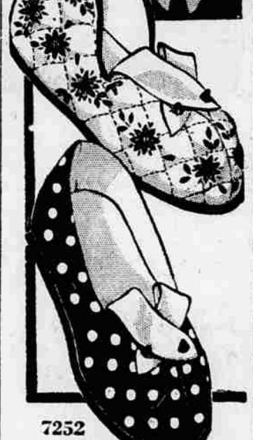
7252 by Alice Brooks

Relax in gay fashion in these dorm favorites — make 'em casual or dressed up with embroidery. Easy — just a sole plus one pattern piece! Pattern 7252: directions; pattern for small, medium, large, extra-large included; transfer of embroidery.