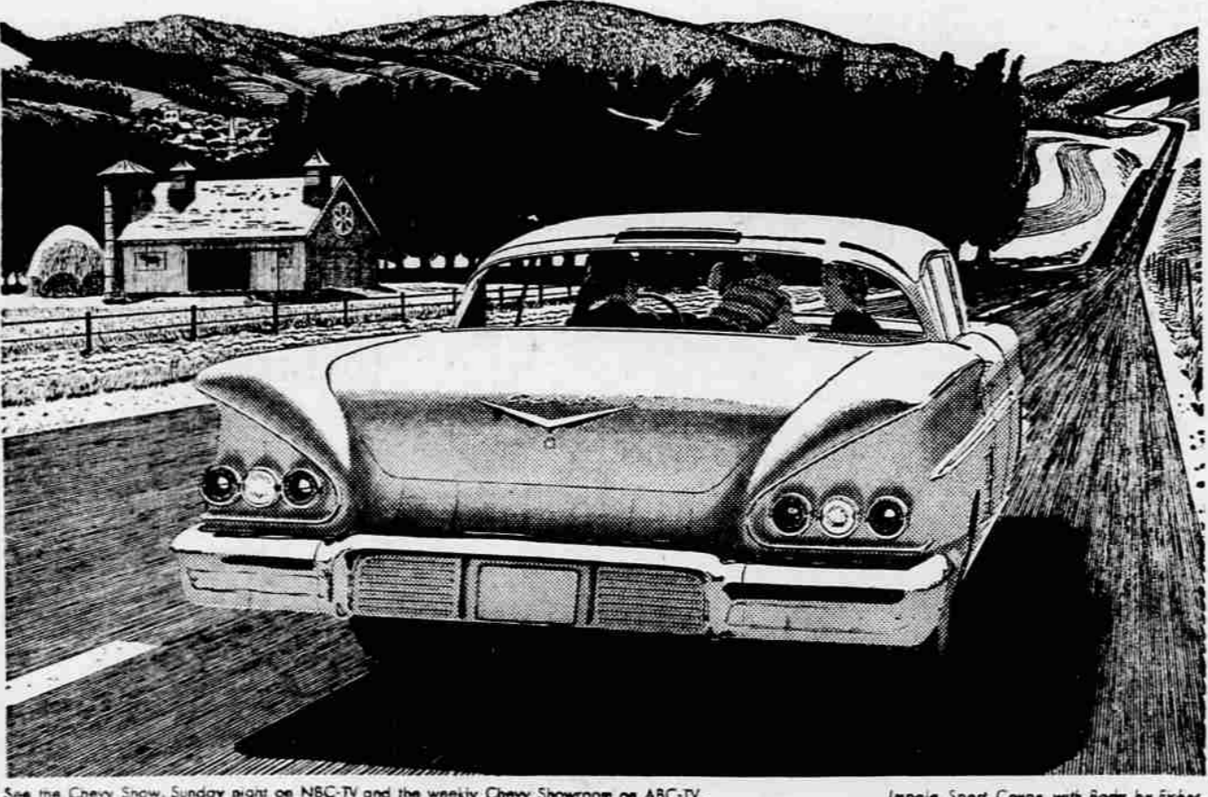
See the Chevy Show, Sunday night on NBC-TV and the weekly Chevy Showroom on ABC-TV. Impala Sport Coupe with Body by Fisher.

America's best buy — CHEVROLET America's best seller!