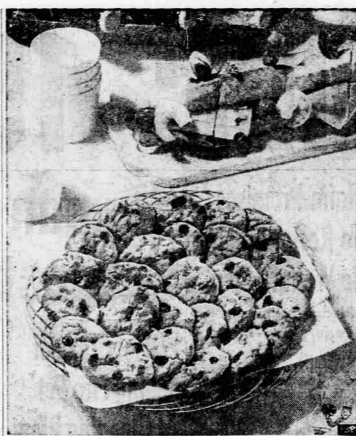
When the crowd comes to your house impress them with this delicious but easy-to-do menu: hearty hero sandwiches, chocolate chip raisin cookies, and beverages. For the sandwiches, provide the fixings, bread, cheese, ham, etc., and let the guests assemble their own. For the dessert use one package of chocolate chip cake mix to make a generous batch of delicious cookies, that will make a big hit with everyone.

Most revolutionary appliance in years. Peels potatoes without lifting a finger. No work. No peels. No blades. No knives. No motors. Washes and peels 2 lbs. in one minute. By mail $6.95 Medford Distributors P. O. Box 846 - Medford, Ore. Tel. SP 2-6151, Rm. 518