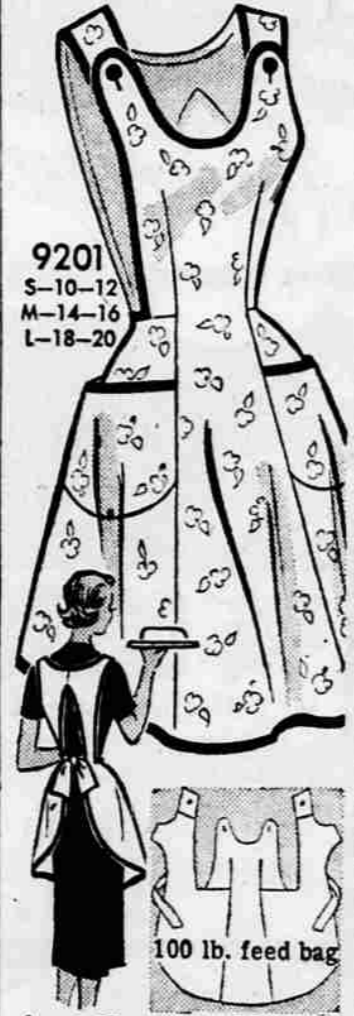
9201 S-10-12 M-14-16 L-18-20 by Marian Martin

Use a 100-lb. feedbag or colorful remnants—make this apron to keep you pretty on kitchen duty! See diagram—easy with our Printed Pattern!