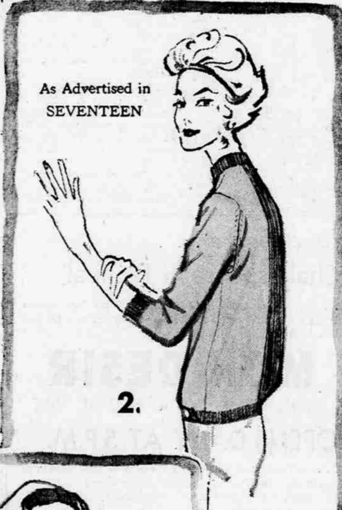
As Advertised in SEVENTEEN