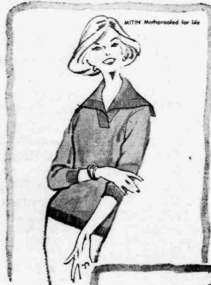
MITIN Motherproofed for life

The plan for this year will call for the concession stands to be erected along the main street where space permits. Some of the program events will also be presented in vacant lots along the highway. The VFW field will be used for events requiring larger areas.