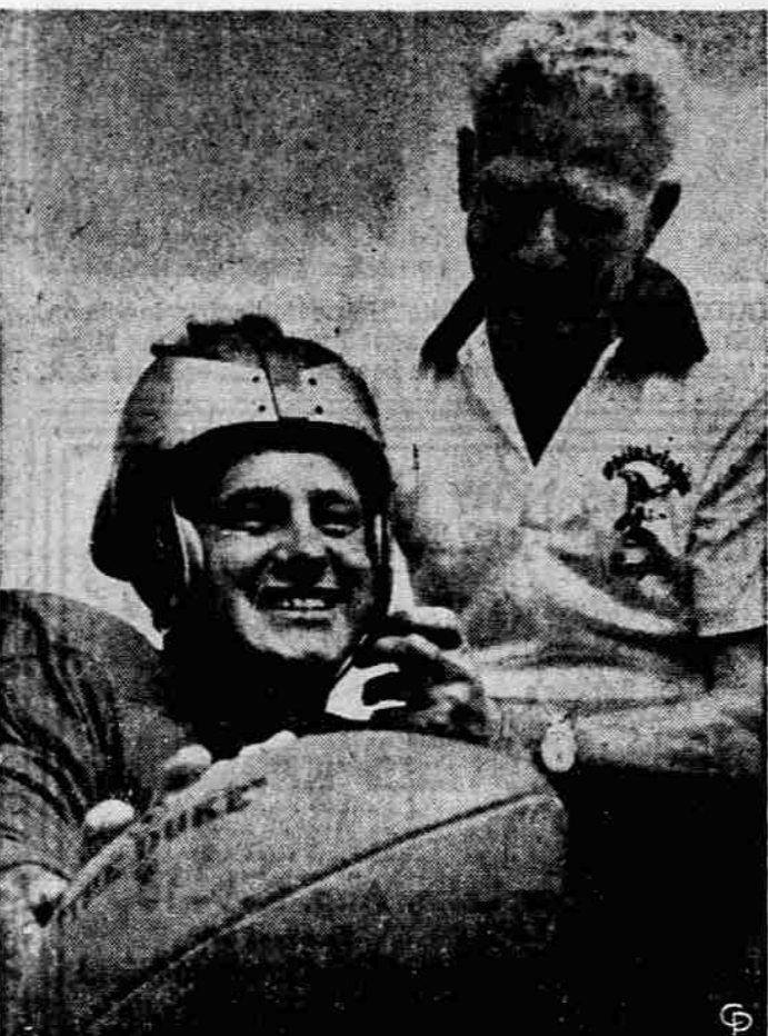
OPENING TRAINING at Hershey, Pa., Norman Van Brocklin, former Los Angeles Rams quarterback, gets helmet fitted by Buck Shaw, new Philadelphia Eagle coach.

Alberta province in Canada has more than 4,000 oil wells.