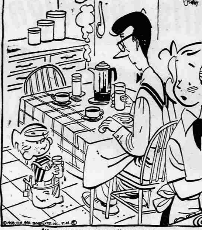
"MY SLINGSHOT HANDLE, WHAT DO YOU STIR YOUR ORANGE JUICE WITH?"