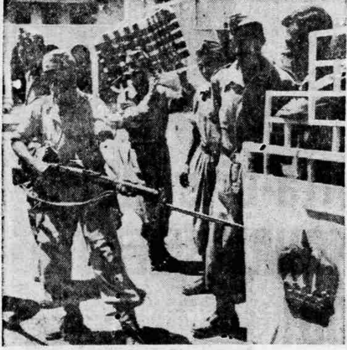
HOSTILE —Laughing Iraqi soldiers relax in courtyard of late King Faisal's palace in Baghdad. Armed soldier aims his bayonet at crown on wall, symbol of his former monarch.