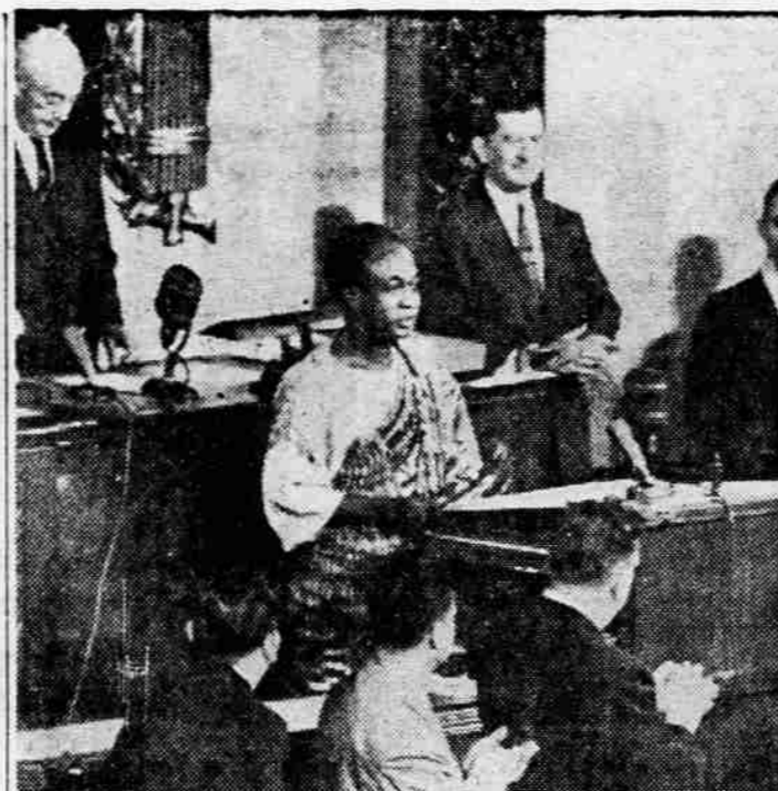
AFRICAN LEADER —Prime Minister Kwame Nkrumah of Ghana, wearing his native costume, receives a standing ovation from the House of Representatives in Washington. Standing at upper left is Speaker of the House Sam Rayburn.

and have no private administration of the sort which has become an integral part of the blood circulation of our free enterprise system... More Know-How... "Not only is our financial power, on all levels throughout our land to the Potomac, and from the smaller banks in our thousands of towns to the skyscraper financial institutions in our big cities, far greater than that of even the combined Moscow - Peiping bloc, we also have more knowledge than the Reds in what to do with commercial credit."