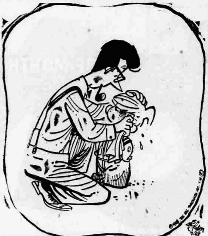
'I DID GIVE HIM THE OL' ONE-TWO. BUT HE CAN COUNT FASTER ME!'