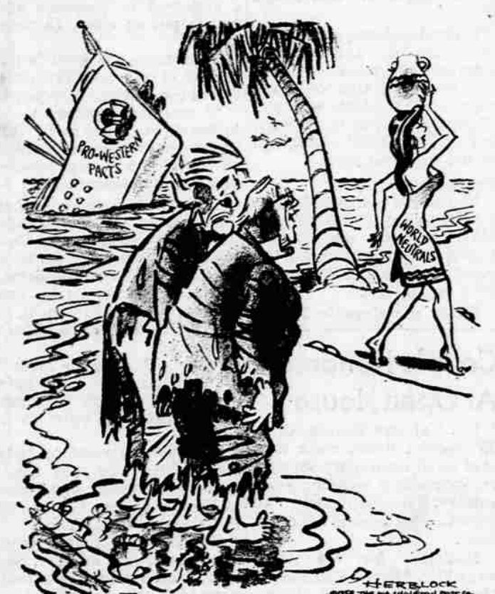
"The Natives Are Looking Kind of Attractive"