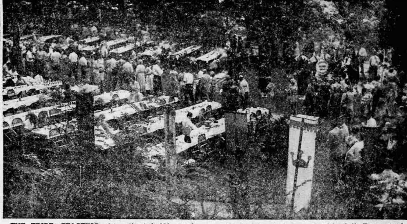
THE TRIBE—FEASTING—An estimated 850 people attended the opening night banquet of the 18th Shakespearean Festival last night in Lithia park, then attended the first of the four plays later. The general view above shows many of them standing in line for the food, served

cafeteria style, which was catered by Julie Tummers of Mon Desir Dining inn. At the right members of the Ashland Kiltie Band can be seen serenading the diners. Other entertainment was furnished by Festival singers and dancers.