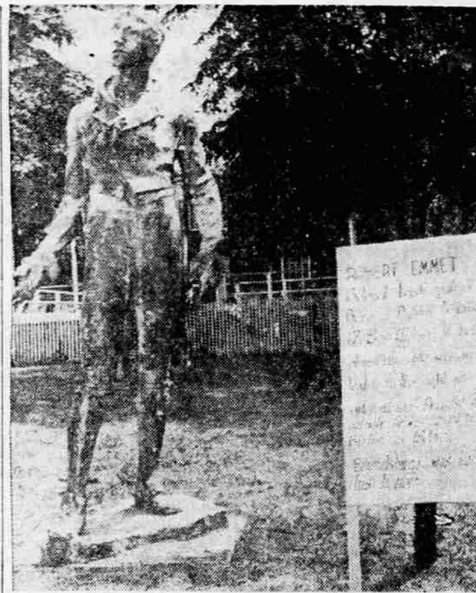
TRAVELING IRON MAN —This statue of Irish patriot Robert Emmet disappeared from Minneapolis and turned up firmly embedded in Emmetsburg, Ia., a town named after Emmet. Proud Hibernians in Emmetsburg say it's going to stay where it is; Minneapolis wants it back.

Georgia leads the country in production of peanuts, paper-shell pecans and pimientos.