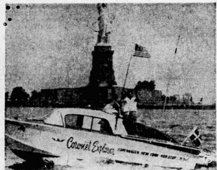
PASSING STATUE OF LIBERTY , New York harbor, outboard motor boat, Coronet Explorer, completes 4,100-mile journey from Copenhagen. It was refueled en route.