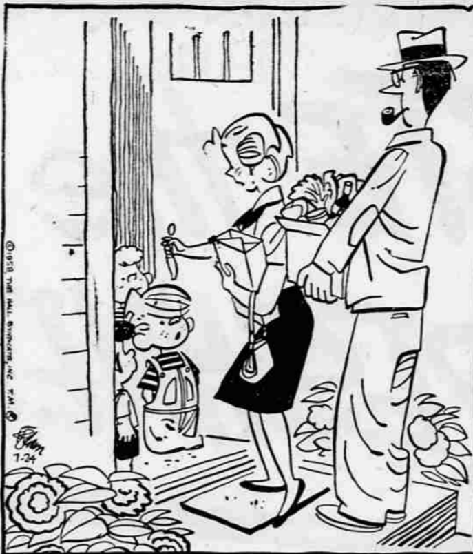
"DOES NEW WALLPAPER COST VERY MUCH?"