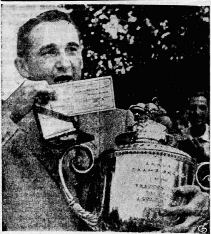
HOLDING PRIZES, Dow Finsterwald, Tequesta, Fla., has arms full with trophy, medal and top money check after winning Professional Golfers' Association championship at Havertown, Pa. His score was 276 for 72 holes of tourney.