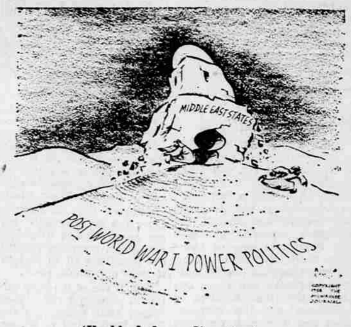
(Herblock Is on Vacation)