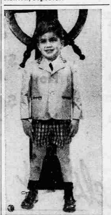
GLAD RAGS.—Sunday-best suit for young toddler combines combed cotton stripe coat with plaid collar and plaid shorts. The outfit by Chips 'n Twigs is made of a washable Lowenstein fabric.