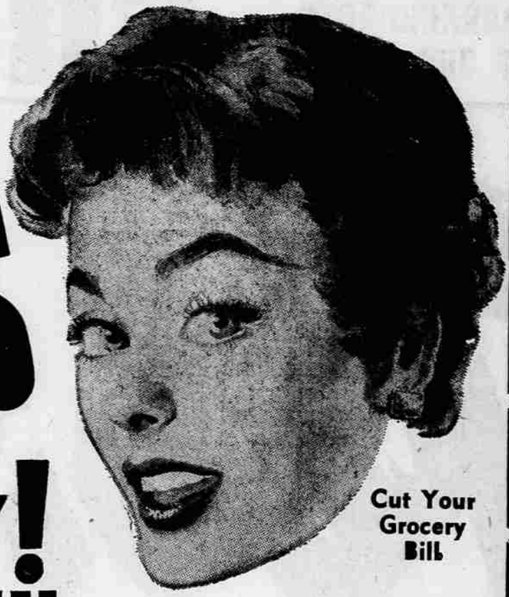
Cut Your Grocery Bill