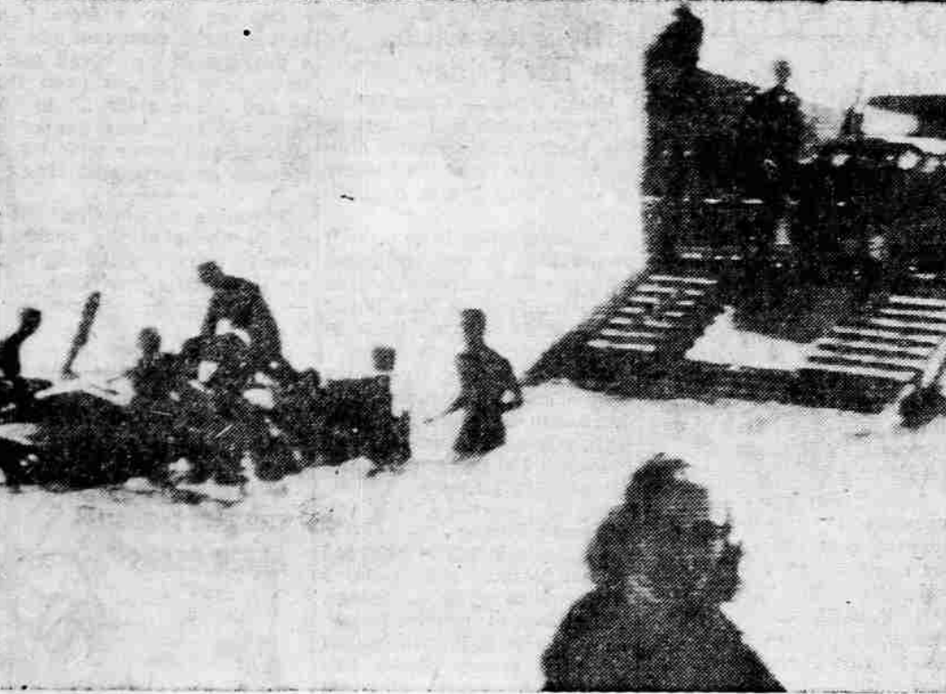
MARINES IN LEBANON—In the photo at left a woman stands in the foreground as United States Marines transfer trucks from landing craft to the shore on Khaldo Beach near Beirut, capital of Lebanon. As the 1,700 American fighting men took control of the city, a second force of