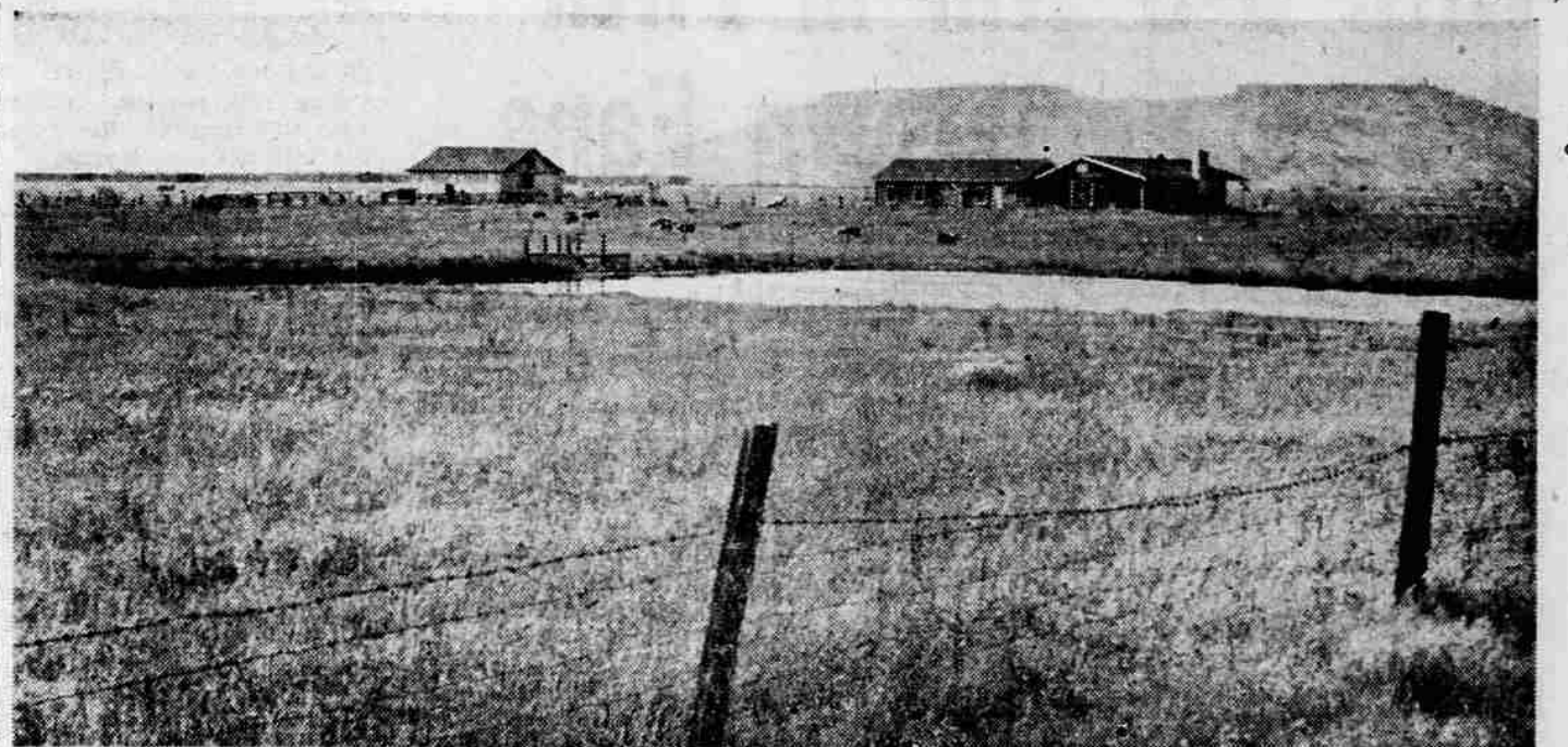
HEADQUARTERS RANCH —This scene shows the headquarters property. Pond in the foreground is stocked with catfish. Ponds in the background are particularly popular before the opening of the trout season on the Rogue. Cattle are shown grazing back of pond.

Open to Public The management land is open to the public the year around for recreational use, but, naturally, to protect the game birds, shooting is restricted to the open seasons. Jackson county is off the recognized flyway for migrating waterfowl but the game property does get some fairly good flocks of birds on the tail ends of storms. By establishing a series of ponds and by scattering food plots, the game commission intends to