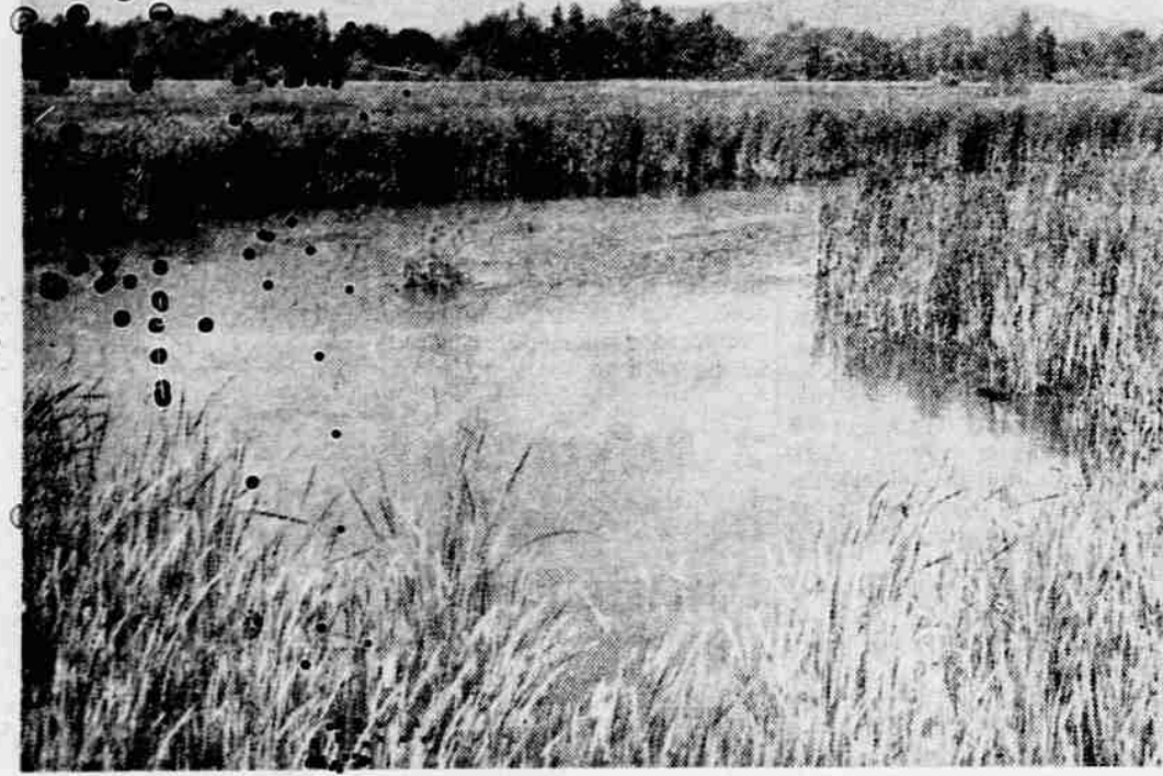
POND CONTRAST SHOWN —Development of cover around ponds in the Rogue Valley Game Management area on Rogue river is illustrated here. Pond in picture with vehicle has been flooded for the first year and vegetation is sparse. The tall growth in the other photo demonstrates the good cover resulting after a pond is well established.