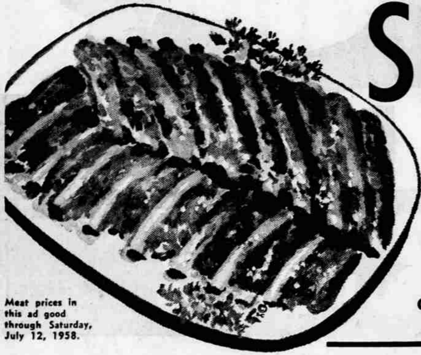
Meat prices in this ad good through Saturday, July 12, 1958.

FRESH Not Frozen Small Sides Ideal for Baking or outside Barbeque 59¢ lb.