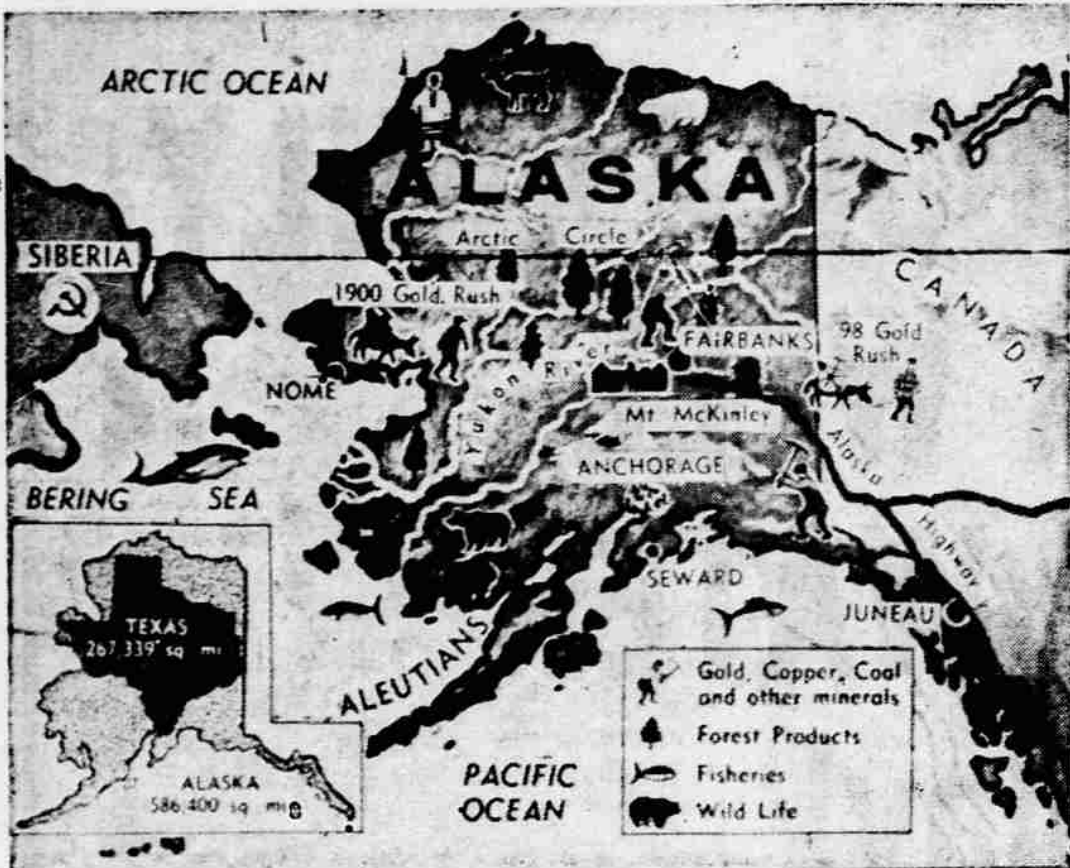
AWAITING SIGNATURE of President Eisenhower is measure giving statehood to Alaska. Inset shows comparative size of Alaska and Texas, now second largest state.